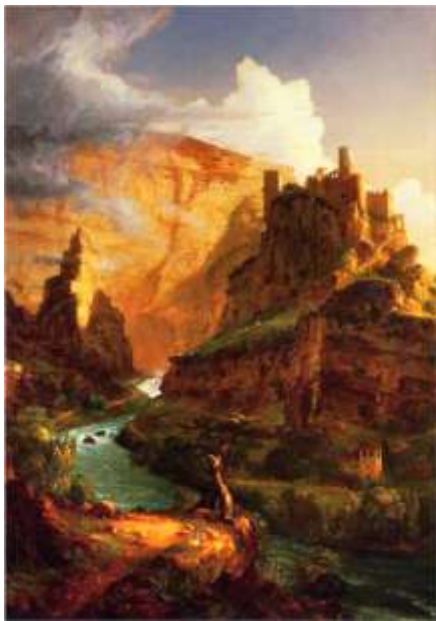
(Artist: Thomas Cole Date: 1841)

My heart remains blessed under the stroke of the divine hammer.