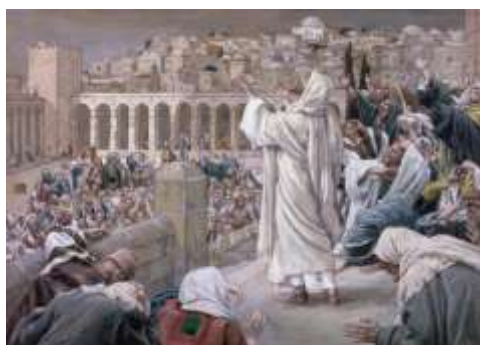
(Artist: James Tissot Date: 1896)

My abode is the entire eternal space. My home is the entire eternal cosmos. My being shall rise above the mortal form. My soul shall rise above the mortal body. Be sure! My soul shall not fear the call of the dark lord.