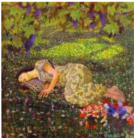
(Artist: Felice Casorati Date: 1913)

No mortal can touch my soul. No mortal can harm my soul. No flames can consume my soul. No liquid can drench my soul. Be sure! No cosmic dream can contain my soul.