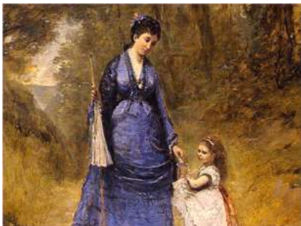
(Artist: Camille Corot Date: 1872)

My mortal matter shall melt into nothingness. My mortal kingdom shall be toppled. Behold! My cosmic mother has given her invitation.