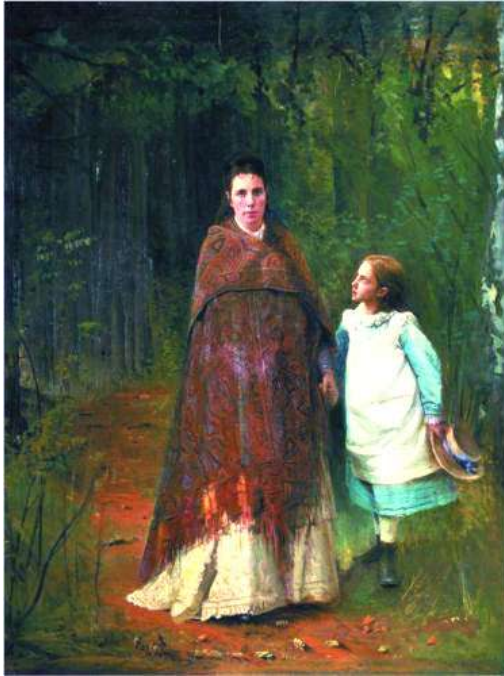
(Artist: Ivan Kramskoy Date: 1875)

My heart ignores the streams of change. My being remains scattered across the interstellar cloud. My being remains only inches away from the borders of this seemingly familiar land. My cosmic mother has given a call. Behold! My cosmic mother has given her invitation.