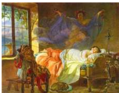
(Artist: Karl Bryullov Date: 1833)

No dream can frighten my soul. No experience can overwhelm my soul. No phenomenon can melt my soul. No misery can overwhelm my soul. Be sure! No cosmic dream can contain my soul.