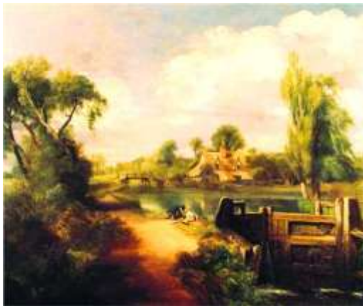
(Artist: John Constable Date: 1813)

My mind is free of artificial excitation. My mind is free of artificial turbidity. My body is the condensed consciousness of the spirit. My soul is the condensed consciousness of eternity. Behold! My soul swallows the river that flows from the eternal kingdom.