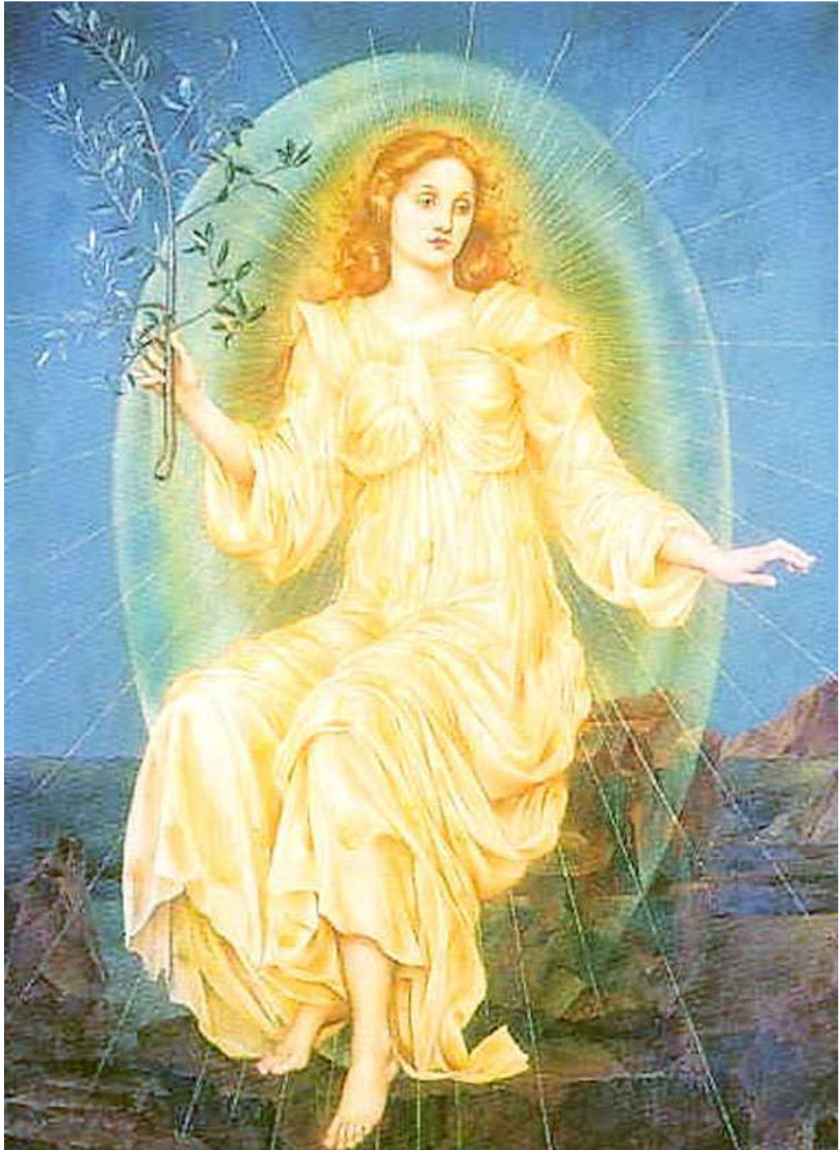
(Artist: Evelyn De Morgan Date: 1855-1919)