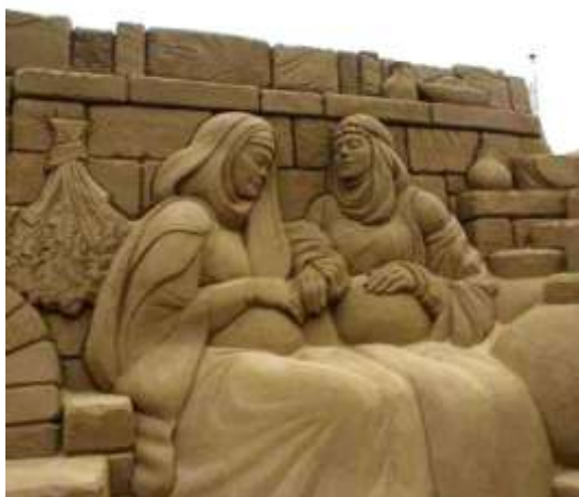
(Visitation Sand Sculpture: Artist: Daniel Glover)

You shall burn your mortal habits. You shall burn your mortal will. You shall not be permeated by desires. You shall not be permeated by lust. Behold! You shall vibrate in wombs of eternity.