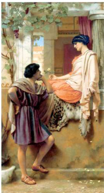
(Artist: John William Godward Date: 1903)

Be sure! You shall quench the desires of many incarnations.